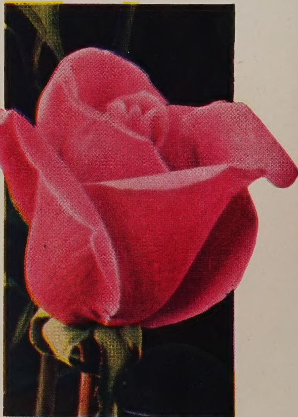
PEARL HARBOR—$1.50 each; 3 for $3.75 (Plant Patent Applied for)